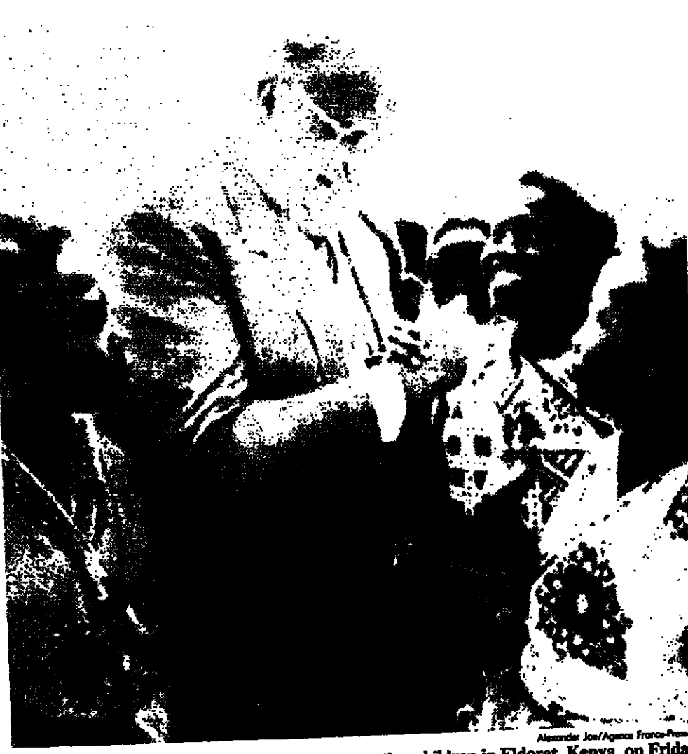
Chancellor Helmut Kohl of West Germany greeting children in Eldoret, Kenya, on Friday.

Agence France-Press NAIROBI — Chancellor Helmut Kohl of West Germany said Friday that "time is running out" for apartheid in South Africa, but he rejected mandatory sanctions or armed struggle against Pretoria as "hypocritical" answers.